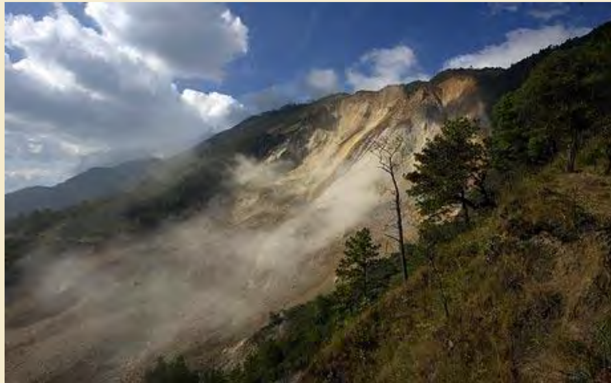
February 2009 Landslide

Volcanoes Earthquakes Landslides Hurricanes Tropical Storms Drought Floods Sink Holes