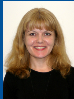
The Psychology of Suicide Terrorism in Chechnya March–July 2007