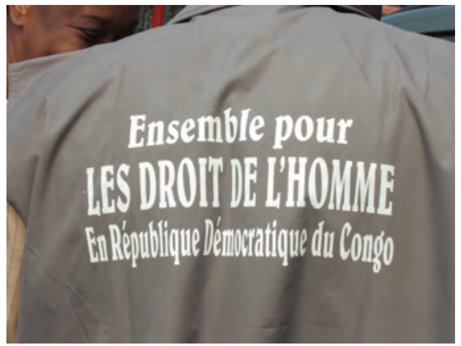
The World Movement Secretariat and the International Center for Not-for-Profit Law (ICNL) have facilitated dialogues and workshops with civil society organizations and other stakeholders around the world. Pictured: the Central Africa Sub-Regional Workshop in Kinshasa, Democratic Republic of Congo, held July 23-24, 2009.

The African Democracy Forum (ADF) – www. africandemocracyforum.org