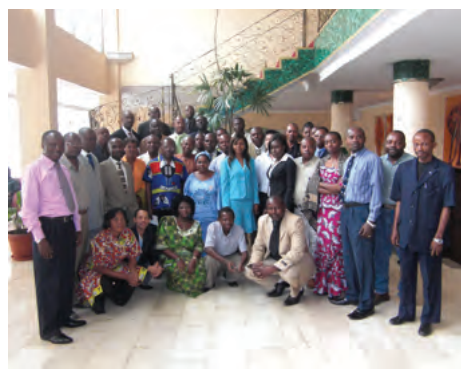
The Central Africa Sub-Regional Workshop on Defending Civil Society was held in Kinshasa, Democratic Republic of Congo-July 23–24, 2009.

bic, Chinese, French, Russian, and Spanish, at http://www.wmd.org/ projects/defending-civil-society.