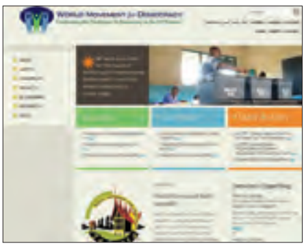
The WMD web site provides information and networking opportunities to democracy activists around the world.

Since the adoption of the Founding Statement at the inaugural Assembly in 1999, the number of participants has grown through the development of both regional and functional networks. These networks have strengthened ties among activists, practitioners, academics, policy makers, and funders who have come together to cooperate in the promotion of democracy. The World