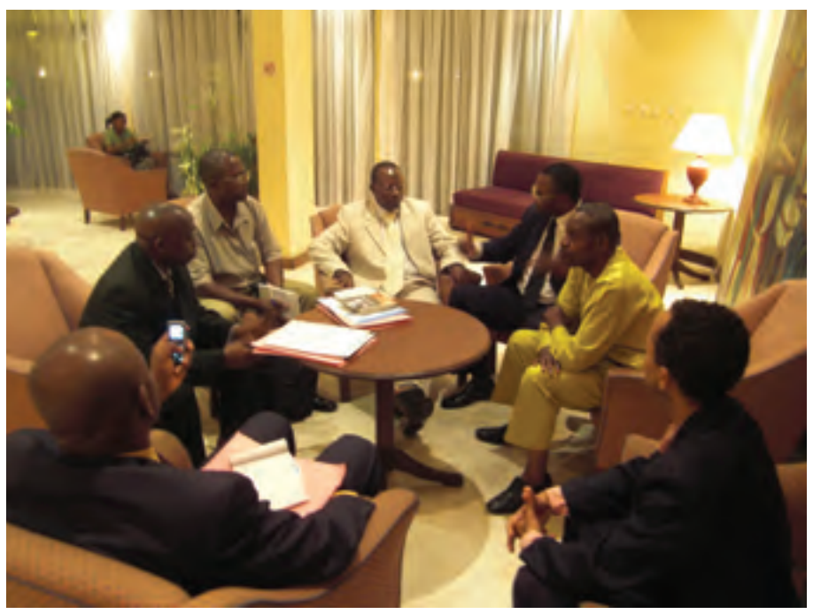
Central Africa's regional democracy activists met in Kinsasha to discuss the Defending Civil Society project.