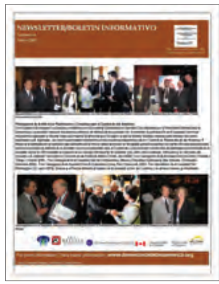
The Latin America and Caribbean Network Newsletter from May 2009.