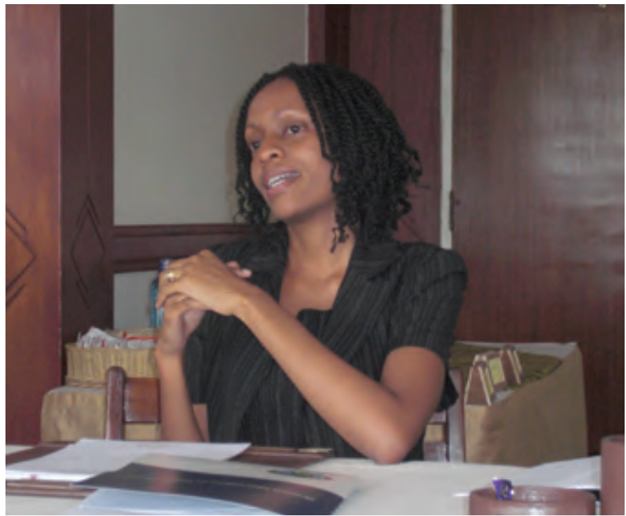
The Africa Regional Workshop on Defending Civil Society was held in Nairobi, Kenya, 25–26 June 2009.