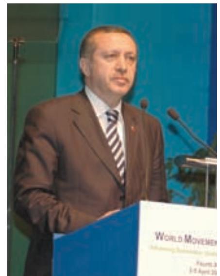
Recep Tayyip Erdoğan, Prime Minister of Turkey