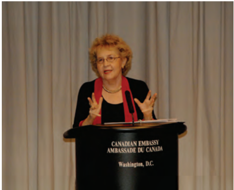
The Fifth Annual Lipset Lecture was delivered on November 12, 2008, by Dr. Jean Bethke Elshtain, the Laura Spelman Rockefeller Professor of Social and Political Ethics at the University of Chicago. Elshtain spoke on the topic "Religion and Democracy: Allies or Antagonists?"

The Democracy Service Medal was presented to Ambassador Max Kampelman on May 22 in recognition of his lifetime achievement in advancing the principles of freedom, human rights, and democracy at an