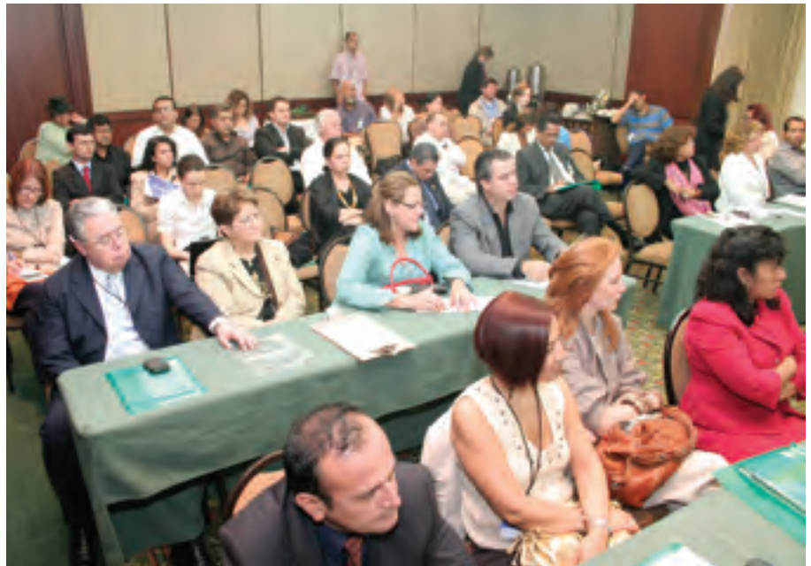
Launch meeting, held in Panama City, on February 28-March 1, 2008 of the Latin America and Caribbean Network for Democracy, the World Movement's most recent regional networking initiative.

Social Network and Resources Database. During the last year, the World Movement Secretariat worked to develop a Social Network and Resources Database for the