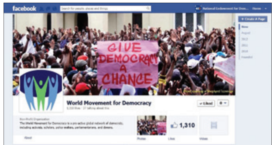
The World Movement's Facebook page can be found at www.Facebook.com/worldmovementfordemocracy

Networking Highlights: The Latin America and Caribbean Network for Democracy (Redlad) continued its efforts to strengthen Freedom of Association in the region. After successfully advocating for the passage of the Organization of American States Freedom of Association and Assembly Resolution, it has remained engaged with several members of the OAS Permanent Council, key officials within the OAS, and other civil society organizations in the region to pursue effective implementation of the Resolution. These efforts included the Redlad in collaboration with the Due Process of Law Foundation and the International Center for Not-for-Profit Law to obtain a special hearing at the Inter American Human Rights Commission on freedom of association in the region. In