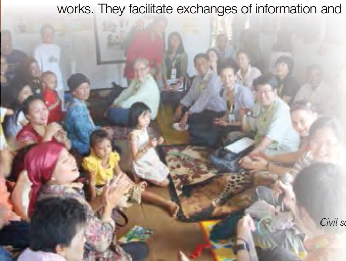
Civil society meeting at the World Movement for Democracy's Sixth Assembly.

For more information about the World Movement for Democracy visit www.wmd.org