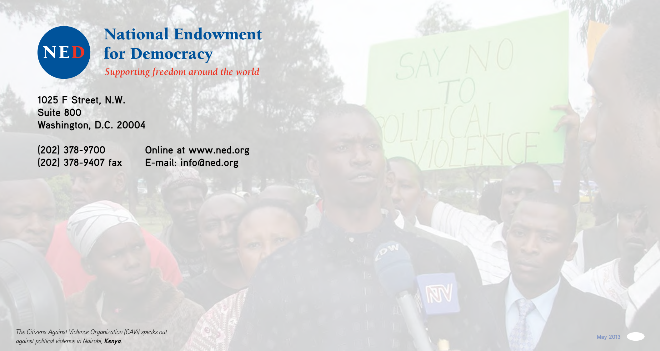
The Citizens Against Violence Organization (CAVi) speaks out against political violence in Nairobi, Kenya.

Online at www.ned.org E-mail: info@ned.org