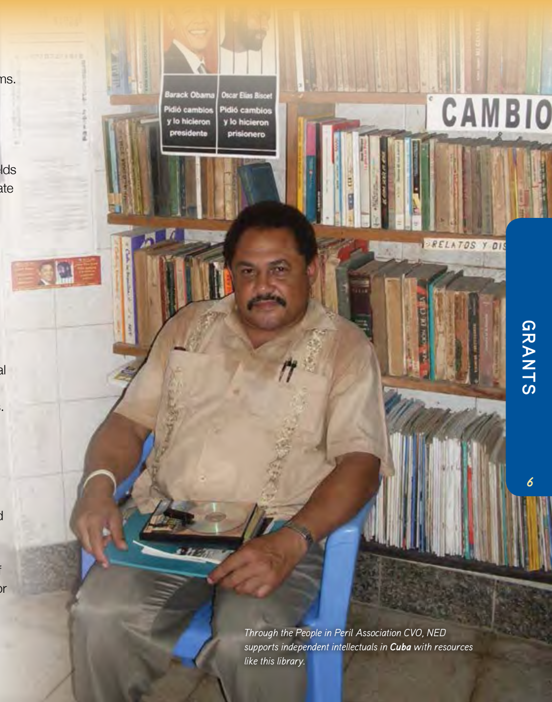
Through the People in Peril Association CVO, NED supports independent intellectuals in Cuba with resources like this library.

For more information about applying for a grant, visit the NED Web site at www.ned.org .