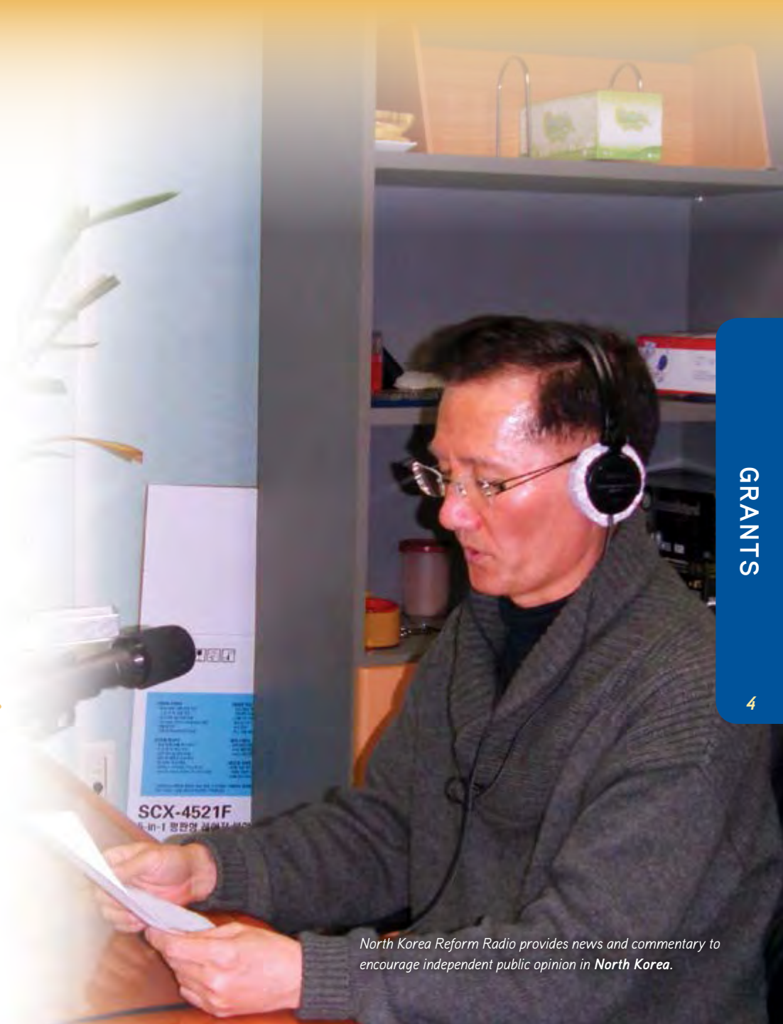
North Korea Reform Radio provides news and commentary to encourage independent public opinion in North Korea.