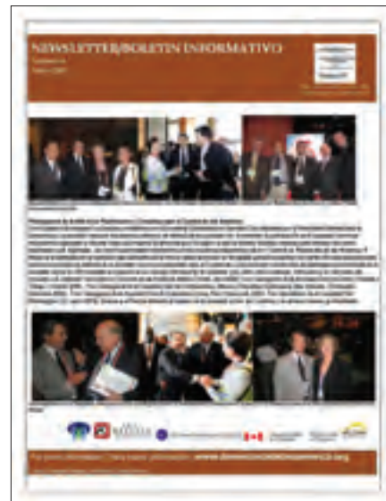
The Latin America and Caribbean Network Newsletter from May 2009.