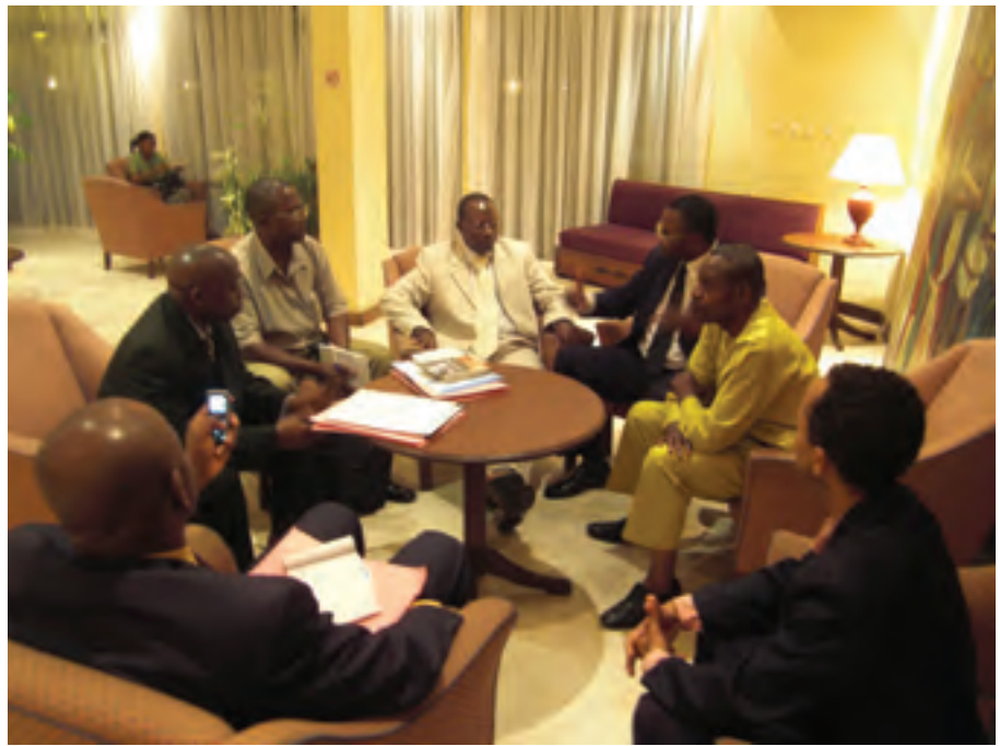
Central Africa's regional democracy activists met in Kinsasha to discuss the Defending Civil Society project.