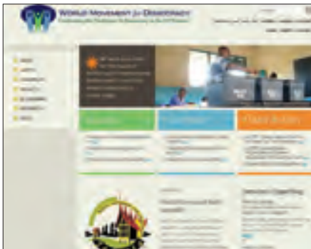
The WMD web site provides information and networking opportunities to democracy activists around the world.

Since the adoption of the Founding Statement at the inaugural Assembly in 1999, the number of participants has grown through the development of both regional and functional networks. These networks have strengthened ties among activists, practitioners, academics, policy makers, and funders who have come together to cooperate in the promotion of democracy. The World