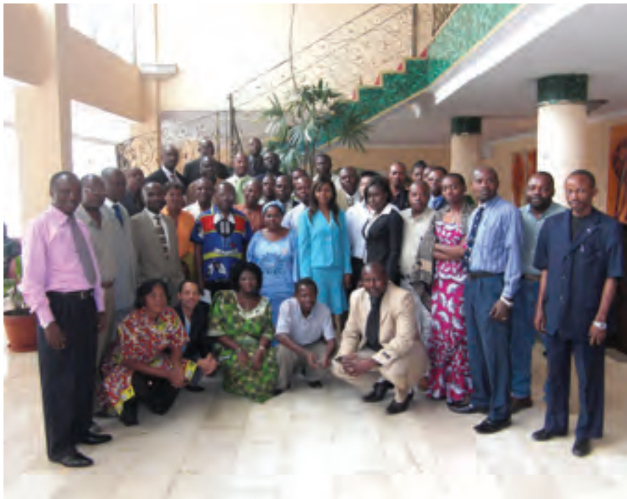
The Central Africa Sub-Regional Workshop on Defending Civil Society was held in Kinshasa, Democratic Republic of Congo - July 23–24, 2009.

bic, Chinese, French, Russian, and Spanish, at http://www.wmd.org/projects/defending-civil-society .