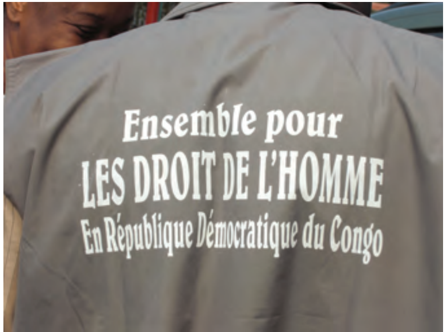
The World Movement Secretariat and the International Center for Not-for-Profit Law (ICNL) have facilitated dialogues and workshops with civil society organizations and other stakeholders around the world. Pictured: the Central Africa Sub-Regional Workshop in Kinshasa, Democratic Republic of Congo, held July 23-24, 2009.