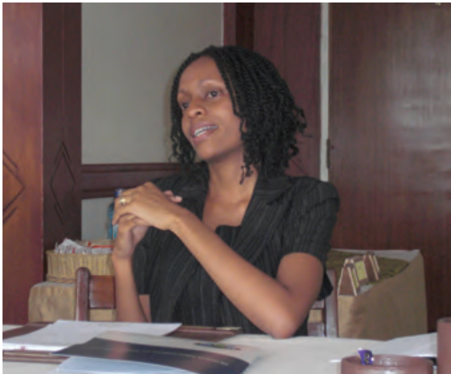
The Africa Regional Workshop on Defending Civil Society was held in Nairobi, Kenya, 25–26 June 2009.